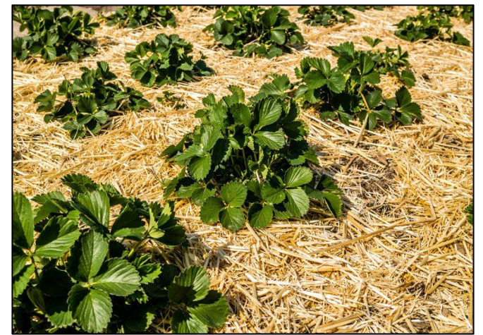
Fig. 3. Organic mulching to maintain soil health